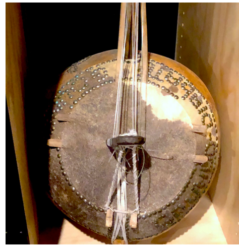
Kora Hint: Instrument Petting Zoo