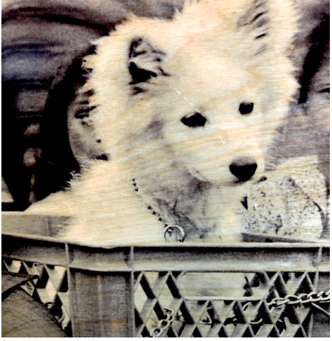
Pup on on bike? Hint: Stories of the Neighborhood