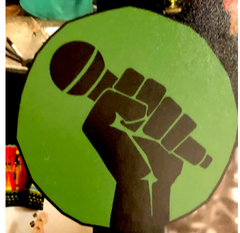
ONEmic Symbol Hint: Sound Underground