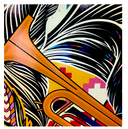
Trumpet Hint: Get Crafty