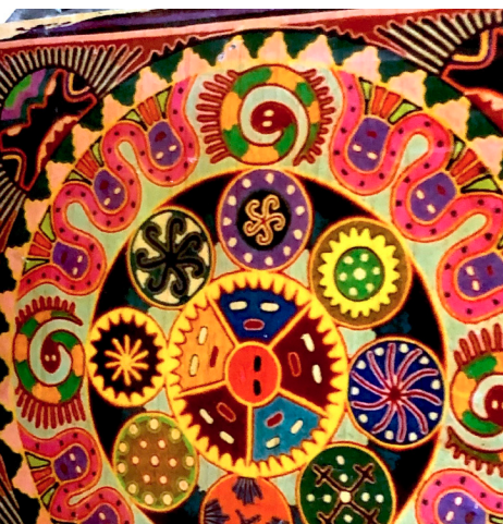
Huichol Yarn Art from Wirrarika Hint: Look Up